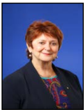
THE HON SUSAN RYAN AO Age Discrimination Commissioner, Australian Human Rights Commission